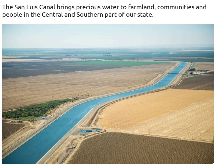
The San Luis Canal brings precious water to farmland, communities and people in the Central and Southern part of our state.