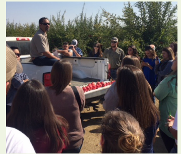
PHOTO: Westlands recently hosted 60 students and staff from Abraham Baldwin Agricultural College in Georgia. The group viewed several crops and engaged in meaningful discussions about farming in California in comparison to the South.

We've been busy educating policymakers and stakeholders on the water efficient agricultural operations in the westside. Special thank you to those growers who participated in the tours and helped illustrate the significance of farming in the Central Valley.