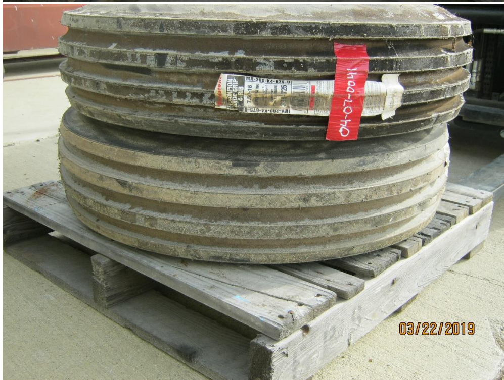
FIRESTONE TIRE 7.50-16LT 8 PLY EQUIPMENT TIRE (QTY 2)