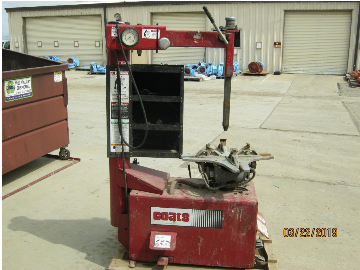
COATS TIRE CHANGER