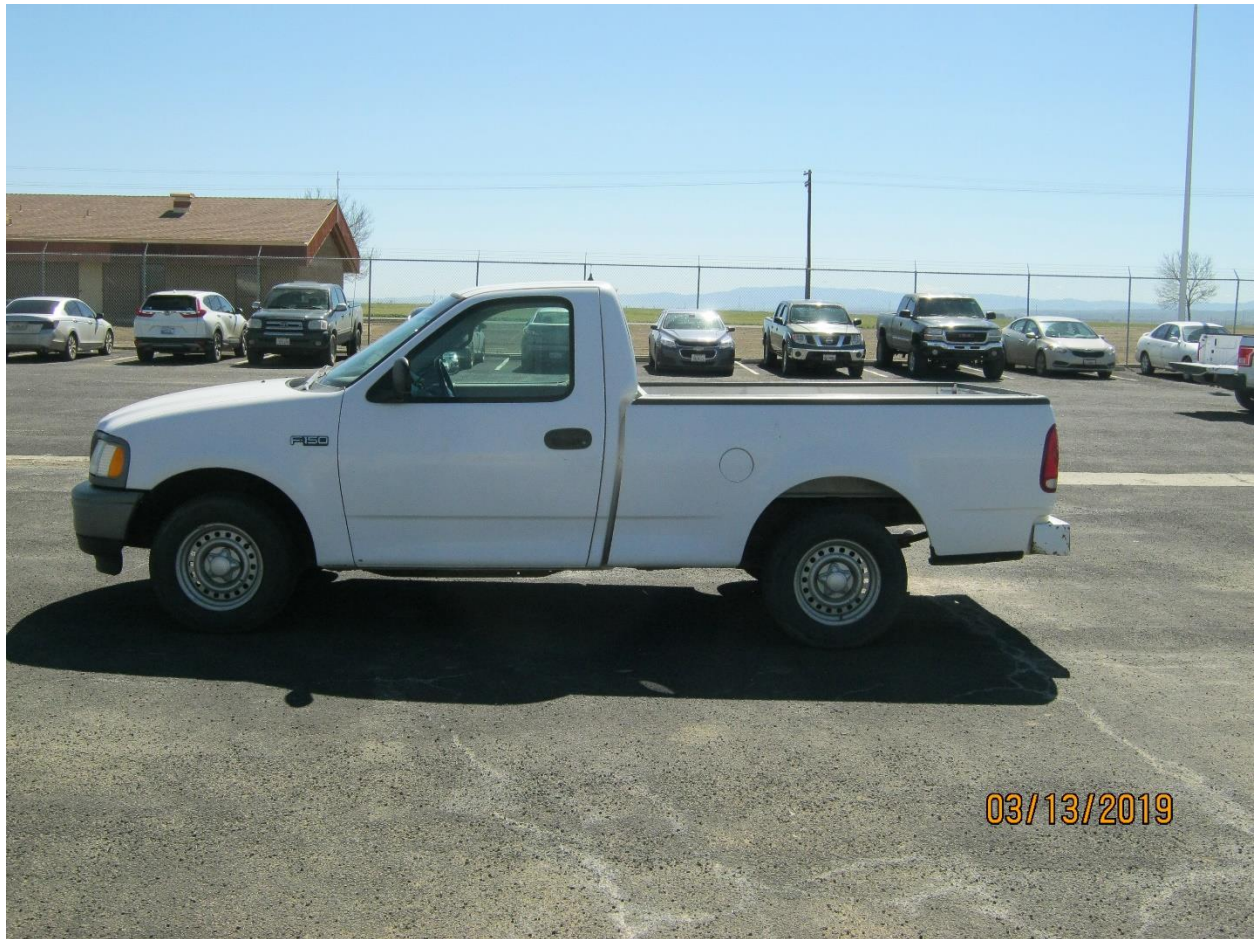
1998 FORD F150 ½ TON 4X2 (VEH 112)