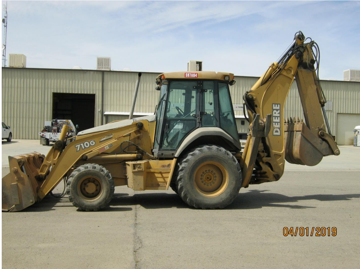
2004 John Deere 710G Backhoe (Veh# 516)