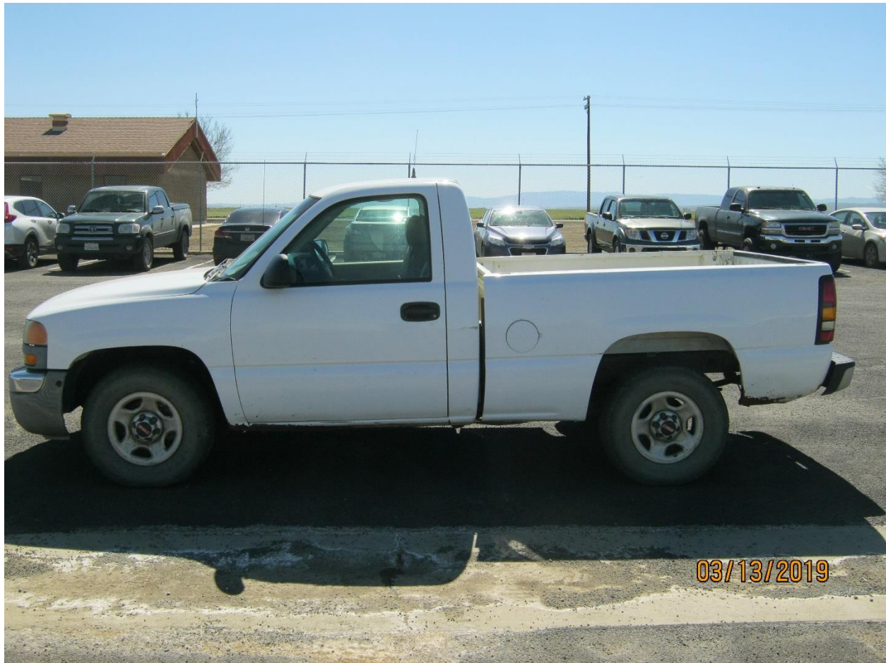
2004 GMC SIERRA 1500 ½ TON 4X4 (VEH 167)