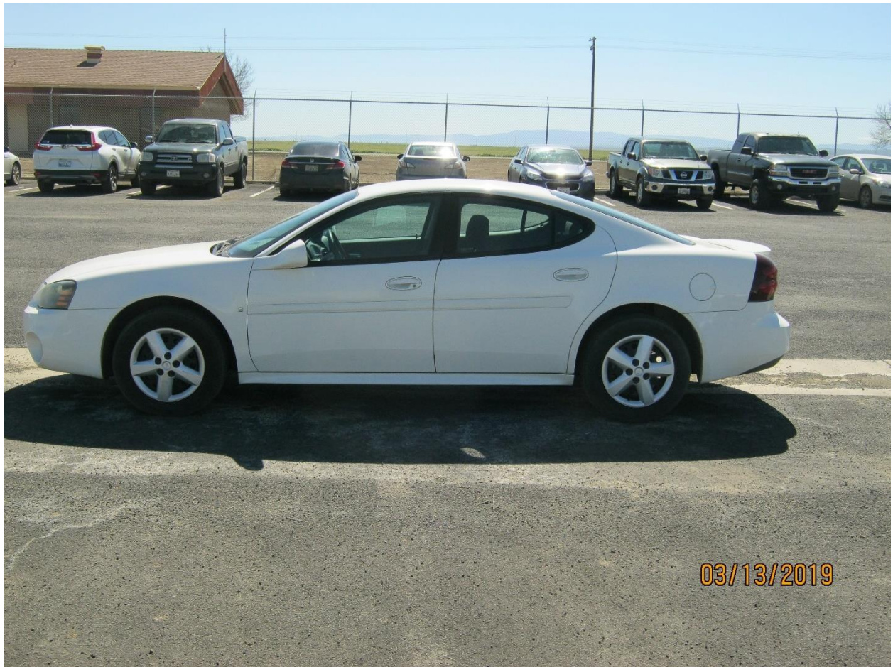
2006 PONTIAC GRAND PRIX 4X2 (VEH 009)