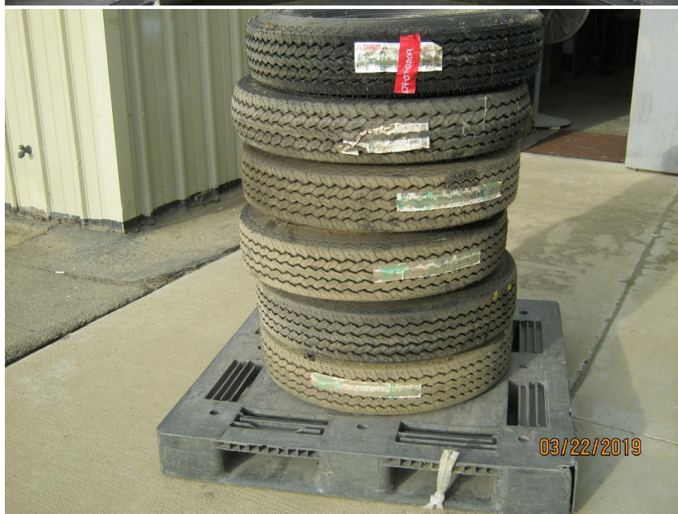
GOODYAR TIRE 7.50-16LT 8 PLY (QTY 6)