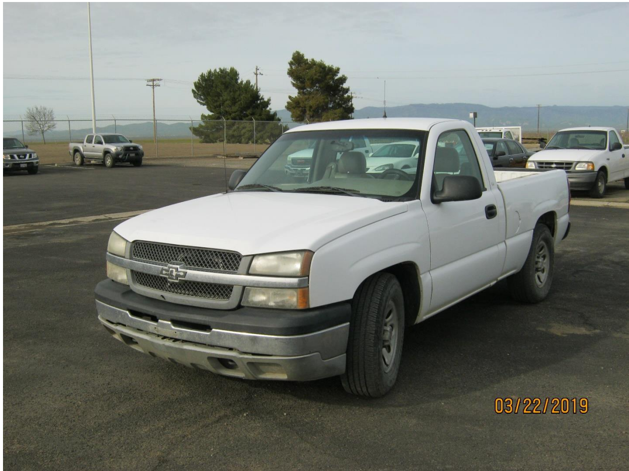
2005 CHEVROLET SILVERADO 1500 ½ TON 4X2 (VEH 174)