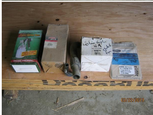
MISCELLANEOUS AUTO/EQUIPMENT PARTS (LOT)