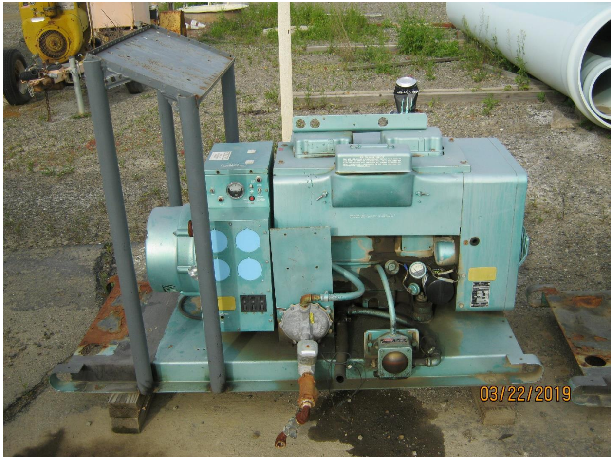
ONAN NATURAL GAS GENERATOR UNIT 3