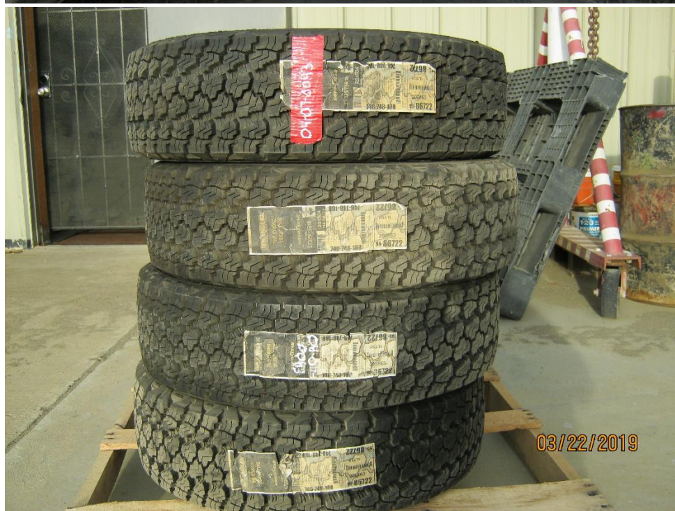
GOODYEAR TIRE 225-75R16 ALL TERRIAN (QTY 4)