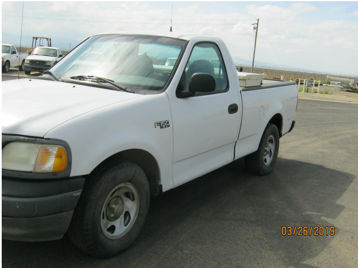
2003 FORD F150 ½ TON 4X2 (VEH 147)