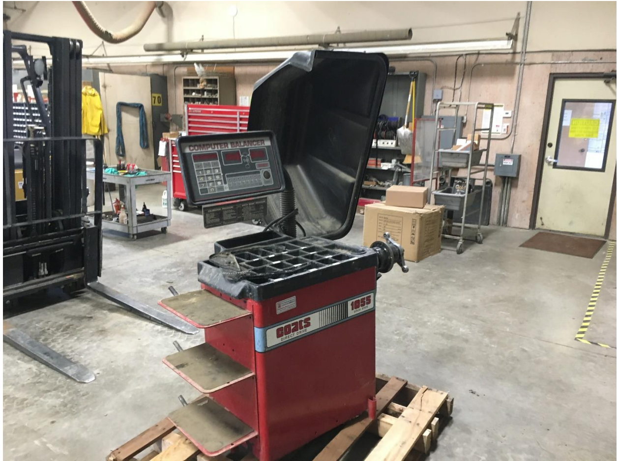
COATS 1055 TIRE BALANCER (NOTE: ELECTRIC DRIVE MOTOR ISSUES)