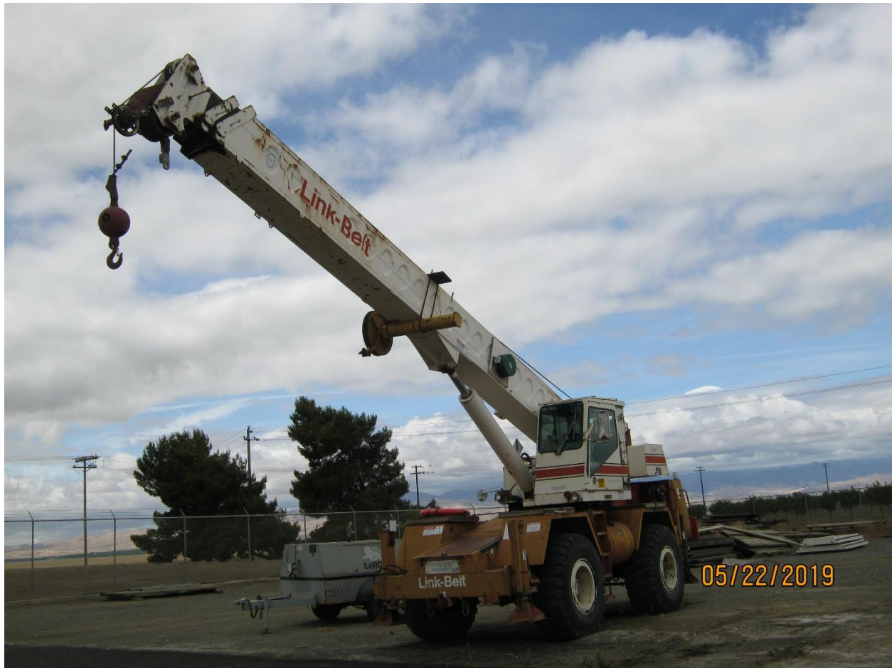
1990 FMC LINKBELT HSP-8028S (VEH 515)