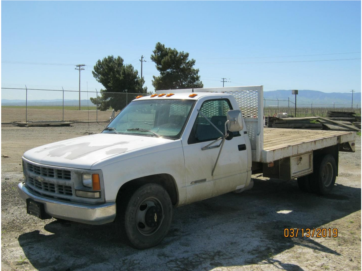
1994 CHEVROLET C-3500 1 TON 4X2 (VEH 398)