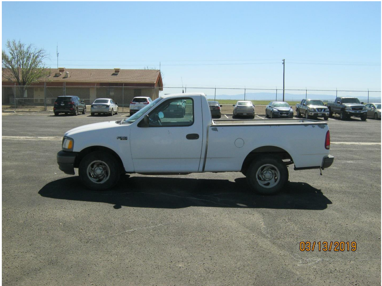
2002 FOR F150 ½ TON 4X2 (VEH 140)