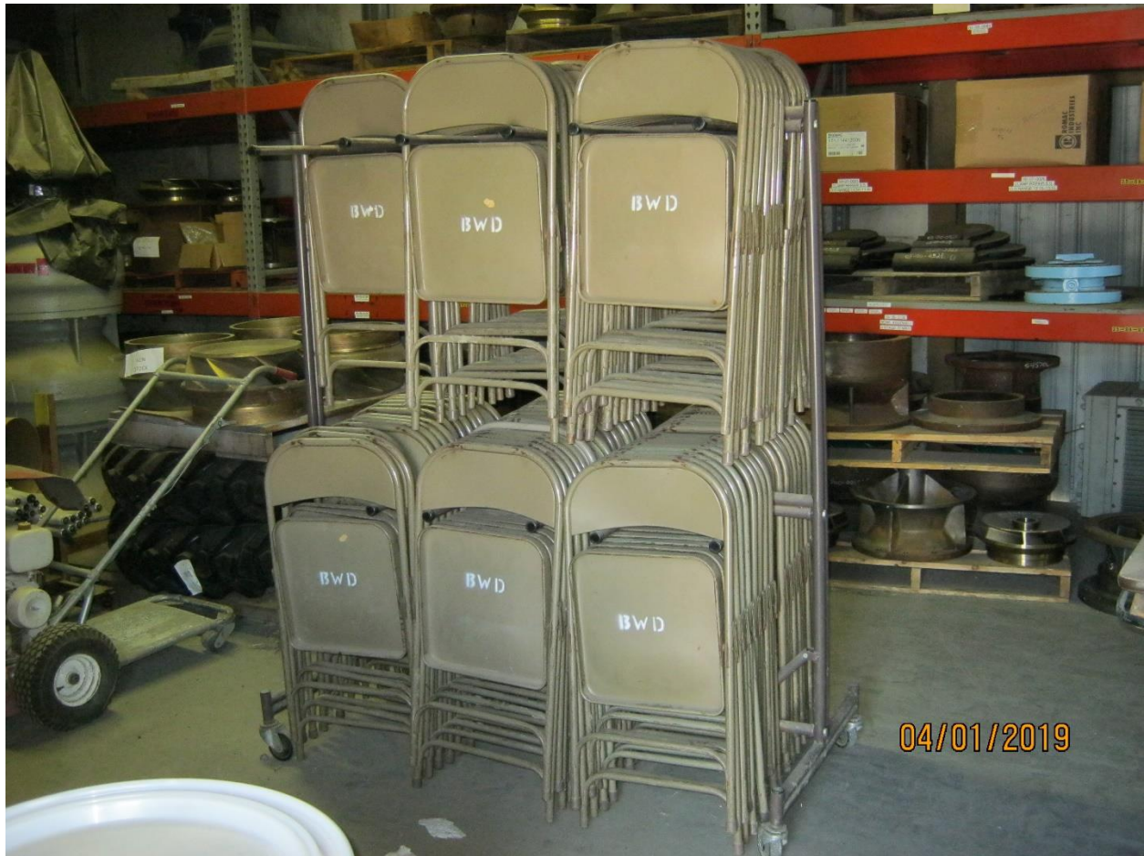
STEEL FOLDING CHAIRS W/ RACK (QTY 69)