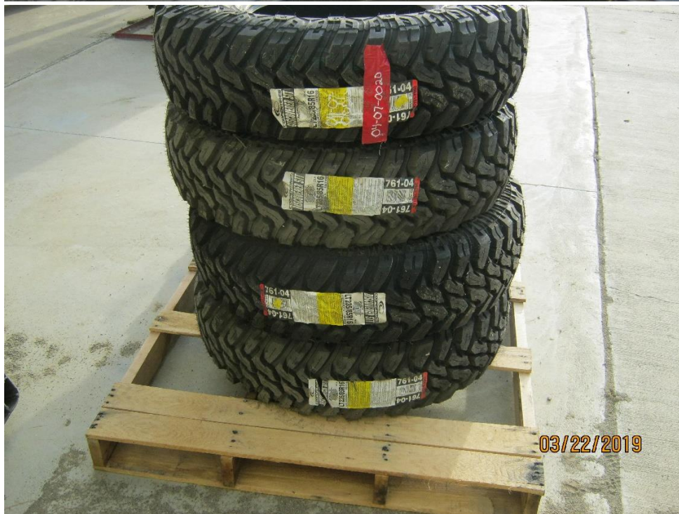
COOPER TIRE LT235-85R16 MUD TERRIAN (QTY 4)