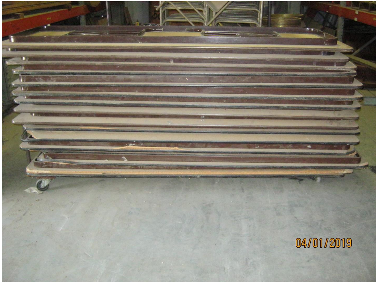
FOLDING TABLES (QTY 14)