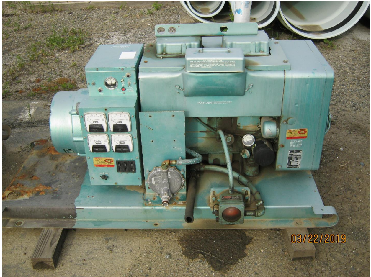
ONAN NATURAL GAS GENERATOR UNIT 2