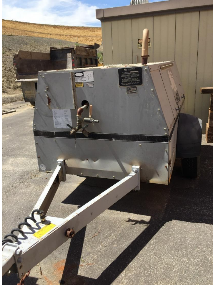
LEROI HQ185DC-1 COMPRESSOR (VEH 436)