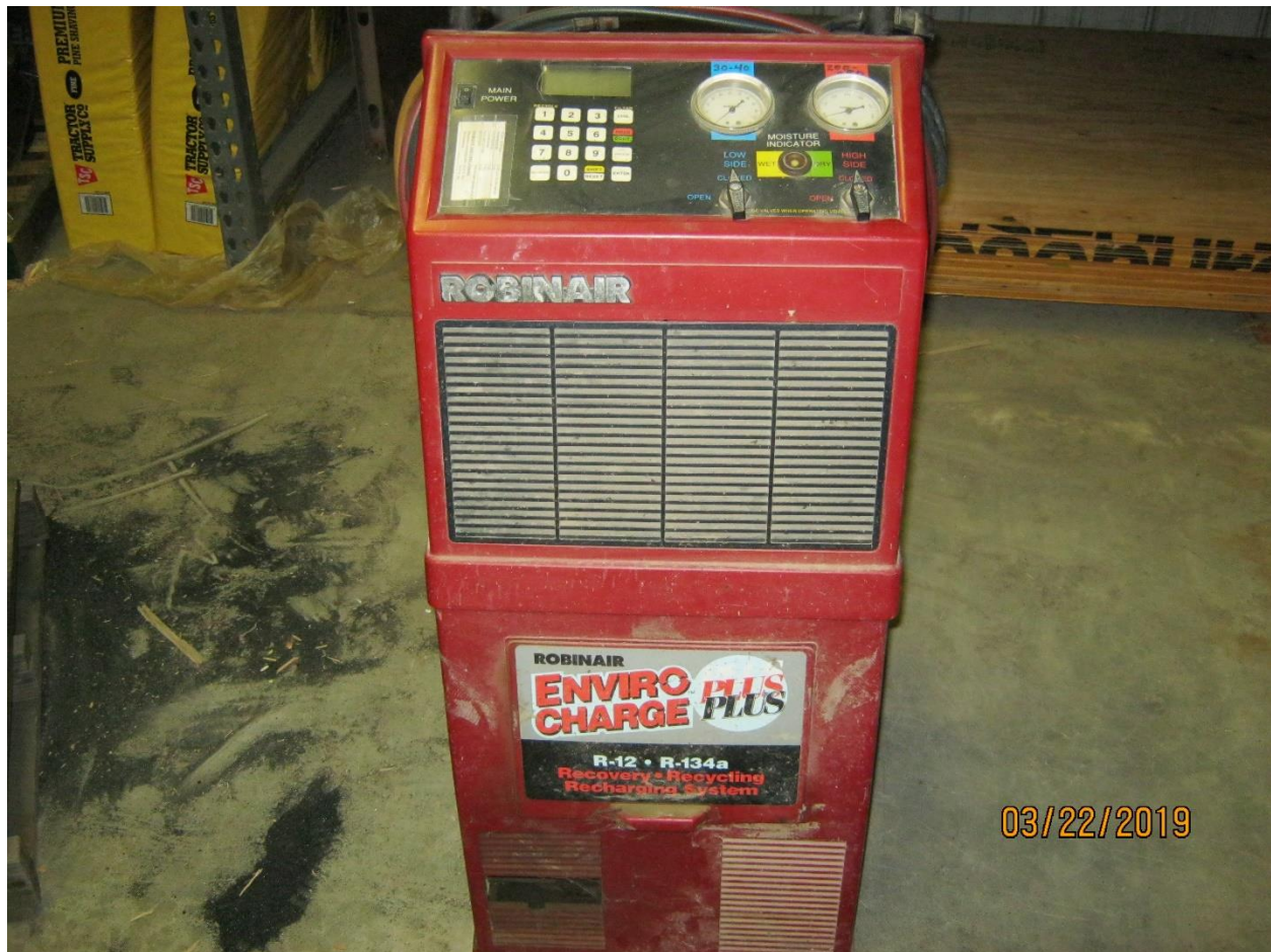
ROBINAIR ENVIRO CHARGE AC SERVICE MACHINE