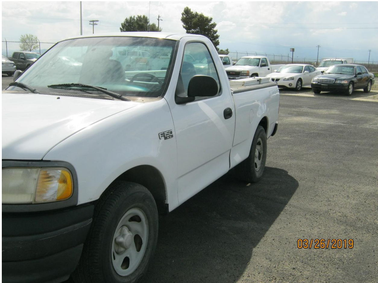
2001 FORD F150 1/2TON 4X2 (VEH 132)