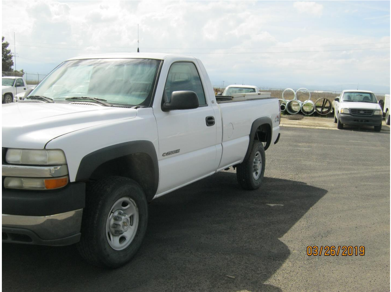
2002 CHEVROLET SILVERADO 2500 ¾ TON 4X4 (VEH 277)