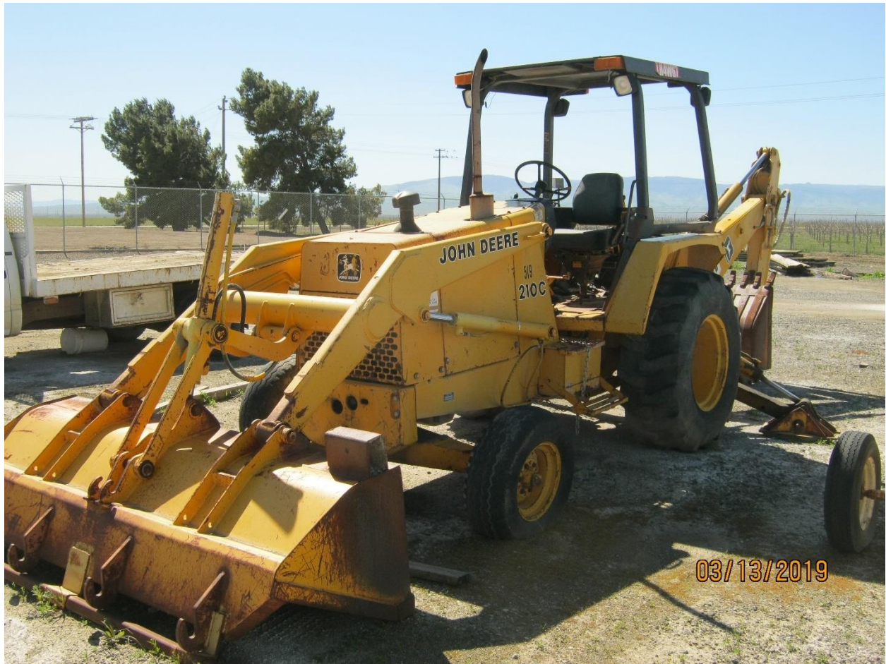
1998 JOHN DEERE MDL-210C BACKHOE (VEH# 519)