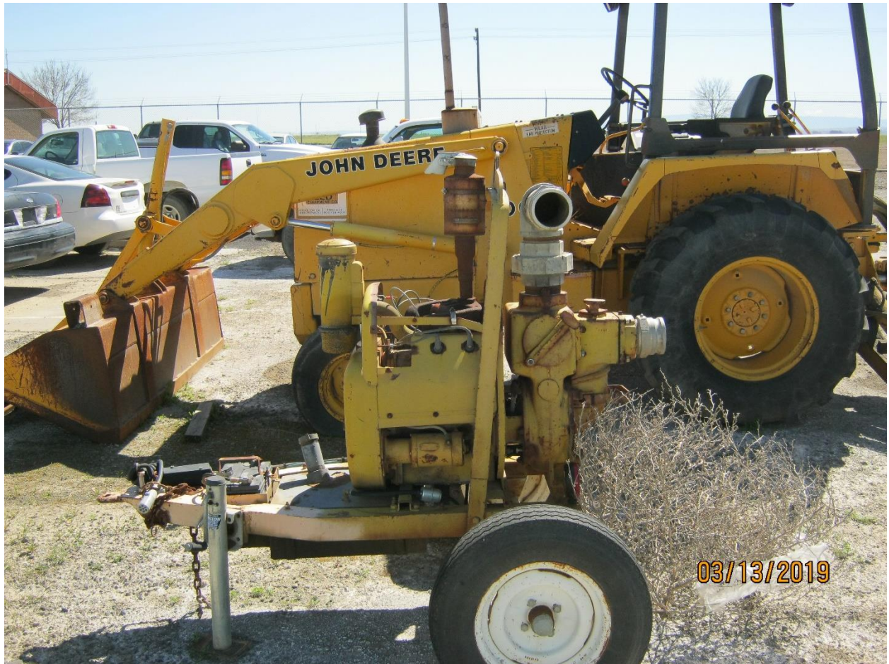
HYDROMATIC WATER PUMP (VEH 427)