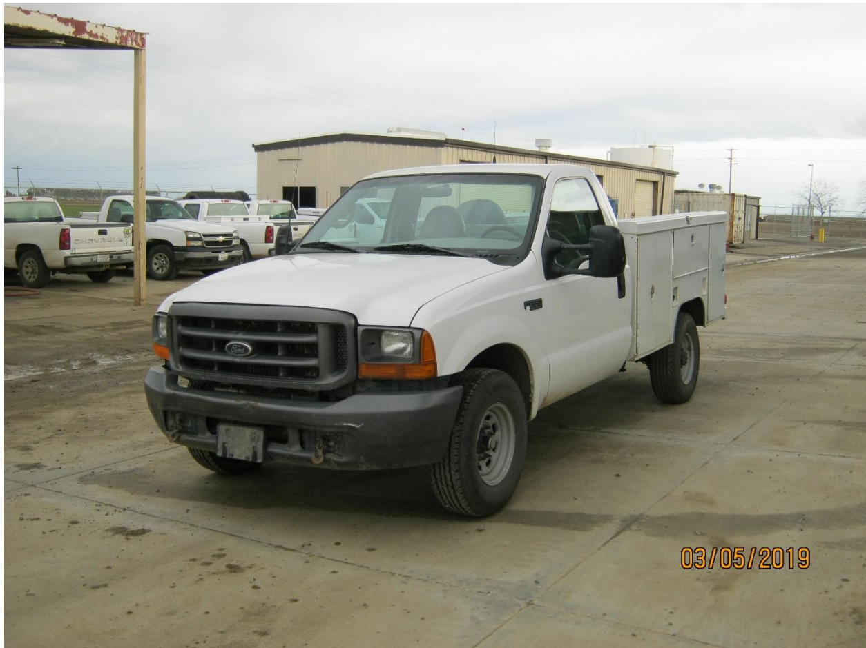
1999 FORD F250SD ¾ TON SERVICE BODY 4X2 (VEH 265)