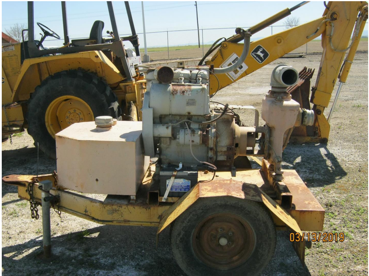
DEUTZ DIESEL POWER WATER PUMP (VEH 432)