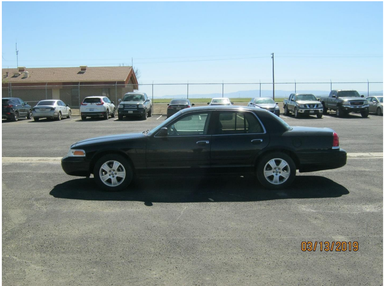
2010 FORD CROWN VICTORIA 4X2 (VEH 015)